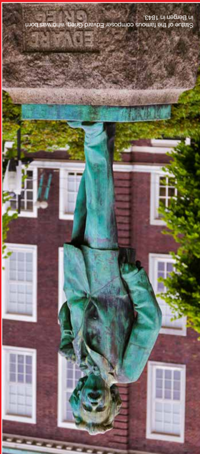
Statue of the famous composer Edvard Grieg, who was born in Bergen in 1843.